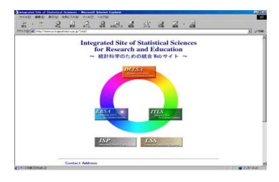
Figure 3. Top Page of Integration

As the inter-university network system is improved, accumulating and sharing digitized educational materials on the Internet will be further required in various areas of education. It is hoped that study of our project working would be of some help.