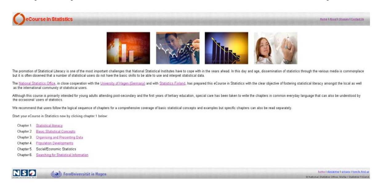
Figure 1. Overview on the content of the e-course

The e-course is currently accessible at <a href="www.fernuni-hagen.de/statliteracy">www.fernuni-hagen.de/statliteracy</a>. It contains six chapters, each sub-divided into a few sections. Each section contains between 2 and 7 screen pages presenting small quantities of information (usually no need for scrolling of screen pages). To date, all chapters except one that will deal with social and economic statistics have been completed.