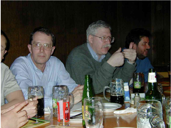
An R Development Meeting (Vienna 2001)